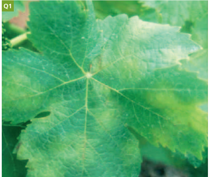
Oilspots are circular and light yellow when young