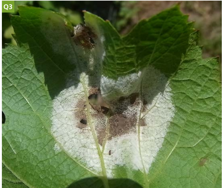
Active viable downy mildew oilspots will show the characteristic fresh white down in the morning after the bag test.