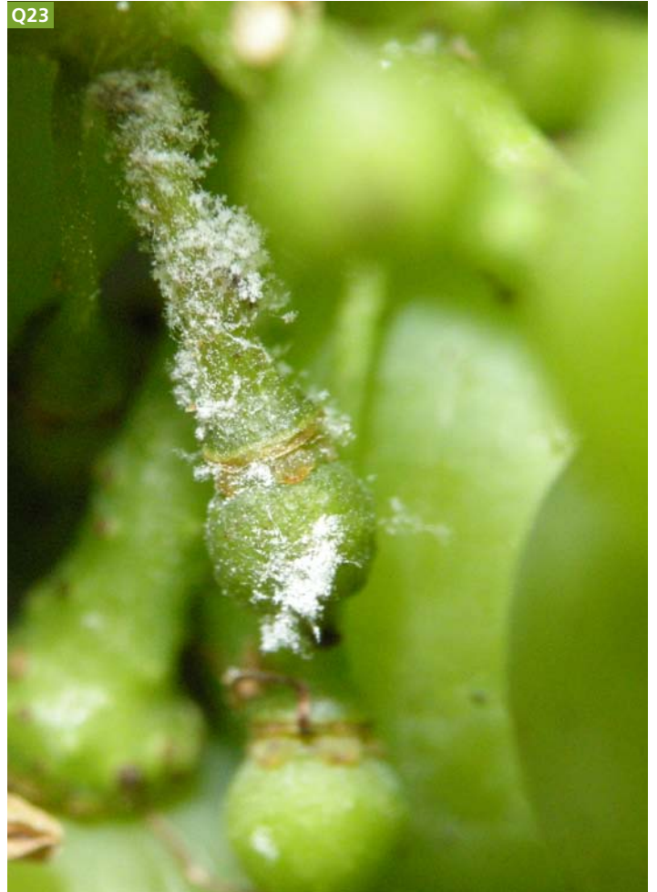
Berries gain resistance to downy mildew when near pea-size but stalks remain susceptible. Note the fresh white down on the infected stalks