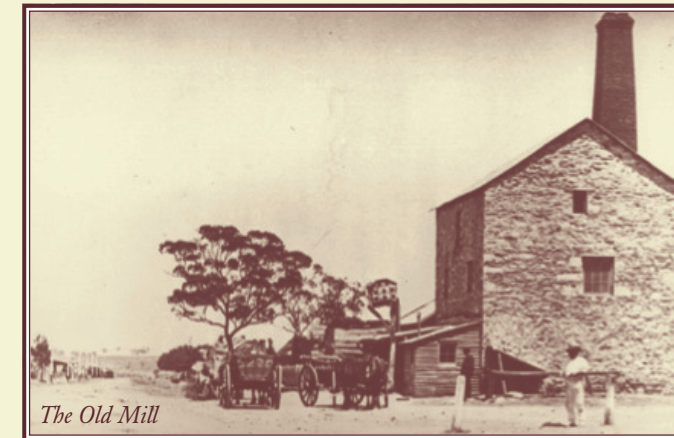
The Old Mill

Constructed of stone as a post and telegraph office with postmaster's house, this is a fine example of a public building of the colonial era. When Australia Post decided to build a new post office in the early 1970's it was intended to demolish the old office and build a new one on the site. As a result of representations by local residents, the old building was saved from demolition. It was purchased in 1972 by the Barossa Valley Archives and Historical Trust which now operates it as a folk museum.