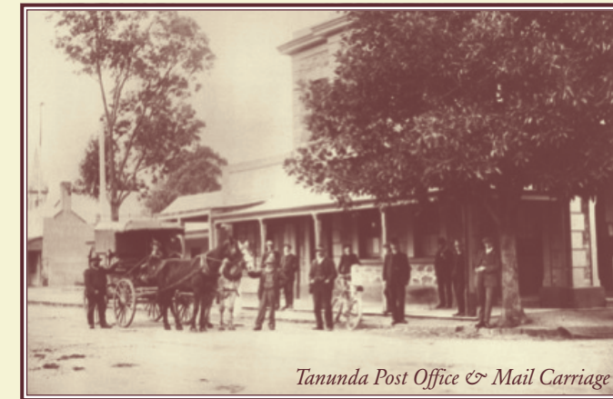
Tanunda Post Office & Mail Carriage

The history of the Tanunda Hotel is almost as old as the history of the Tanunda township itself. The hotel was originally built of local stone in 1845-46, and the first licence was granted in 1847. It was substantially rebuilt and a second storey added following a fire, in 1905-1910. In 1945 it was more than doubled in size. It is an impressive Angaston marble building today, with a long verandah proudly supported by wrought iron columns, and lacework which originated from England.